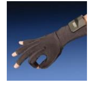
Figure 9. 5DT Data Glove [5]

enables natural form of interaction with objects. The data glove should be used in combination with a tracking sensor, which can be mounted on the wrist. The 6DOF tracking system registers the hand position in 3D space while build-in sensors at fingers register motion of each specific finger.