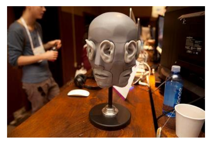
Figure 6. 3Dio's omni-binaural recording set-up.

purposes based on immersive technologies but in many other situations in real life.