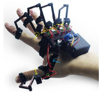
Figure 8. Dexmo On-hand Exoskeleton [4]

A haptic interface [2] is a device that allows the user to with the interact environment performing objects manipulation and exploring their properties by receiving force or tactile feedback. An on-hand exoskeleton Dexmo (fig. 8) designed by Dexta Robotics is an example of the haptic interface [4].