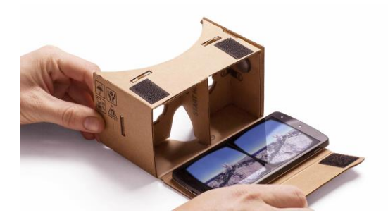
Figure 2. Google Cardboard VR glass using a smartphone

Going beyond glasses-based stereoscopic solutions, a huge number of approaches have been proposed to support naked-eye 3D visualization. The key technical feature characterizing these 3D displays is direction-selective light emission, which is obtained most commonly by volumetric, holographic, or multiview approaches.