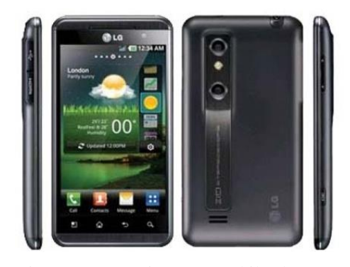
Figure 3. LG Optimus 3D mobile phone equipped with parallax-barrier based autostereoscopic 3Dscreen and stereo camera

Typical multi-view displays, often based on parallax barrier or lenticular lens array, show multiple 2D images in multiple zones in space. They support multiple simultaneous viewers, but at the cost of restricting them to be within a limited viewing angle. A number of manufacturers [9][10] produce monitors based on variations of this technology. Typical state-of-the-art displays use 8–10 directions, at the expense of resolution. A 3D stereo effect is obtained when the left eye and the right eye see different but matching information. It must be noted that parallax barrier based stereoscopic 3D displays can be found in several mobile devices, such as the LG Optimus 3D phone, or the Nintendo 3DS mobile gaming console, which can also be used for presenting 3D material in an educational setting, as well as for capturing stereoscopic images and videos.