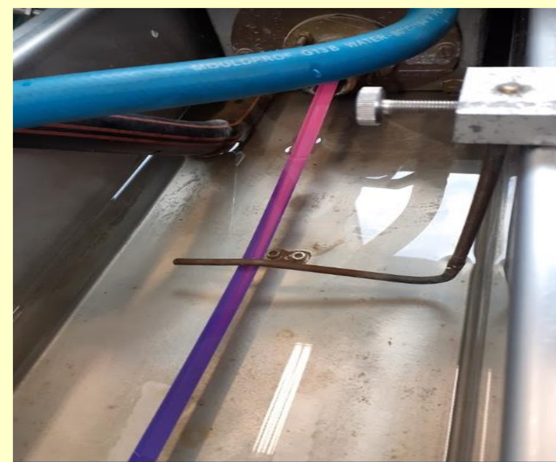
Figure 2: Extrusion of Thermochromic Masterbatch and Polypropylene

Melt processing trials have been carried out using the extrusion process (see Figure 2) and the injection moulding process.