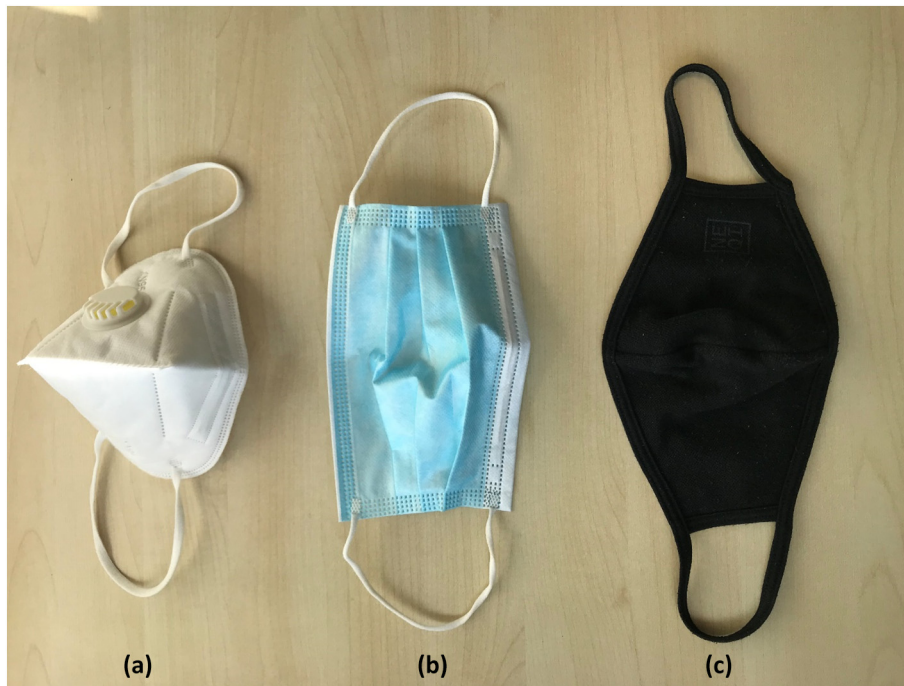
Fig. 1. Examples of disposal face masks and reusable cloth face covering: (a) KN95-type filtering face piece mask, (b) medical or procedural mask, and (c) non-medical reusable cloth face covering.