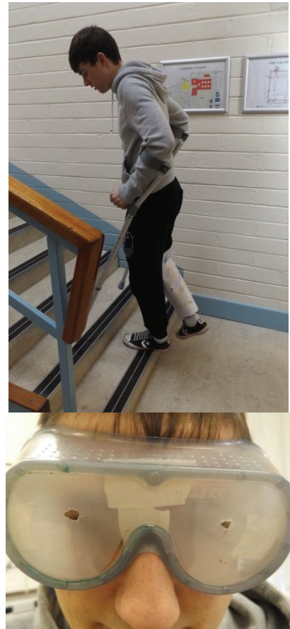
Fig.2 Examples of empathy tools created by learners

Each group is assigned one of the seven principles of Universal Design to research in parallel with empathy testing. They are then encouraged to conduct contextual research in real world situations and document these scenarios through photographs and verbal feedback. The objective for the learner is to extract findings based on their research that define and frame a problem that needs to be addressed. Subsequently a phase of conceptualisation occurs where the first design solutions are investigated and the iterative design process begins. Final solutions are articulated through prototypes and tested with the empathy tools developed in the early stages of the project.