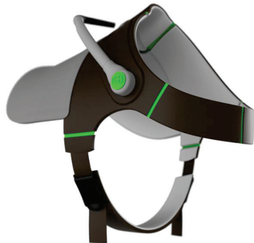
Fig 5. GO therapeutic riding aid designed by Jack Gregan

It was identified through the research phase that there was no specialised equipment available for Therapeutic Horse Riding. Standard riding saddles detached the user from the movement of the horse and bespoke approaches failed to reach on optimum user experience. The key problem identified was the necessity to have the user correctly positioned and supported on the horse, otherwise the therapy is ineffective.