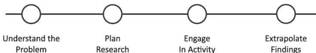
Fig. 1 Key Research Touch Points