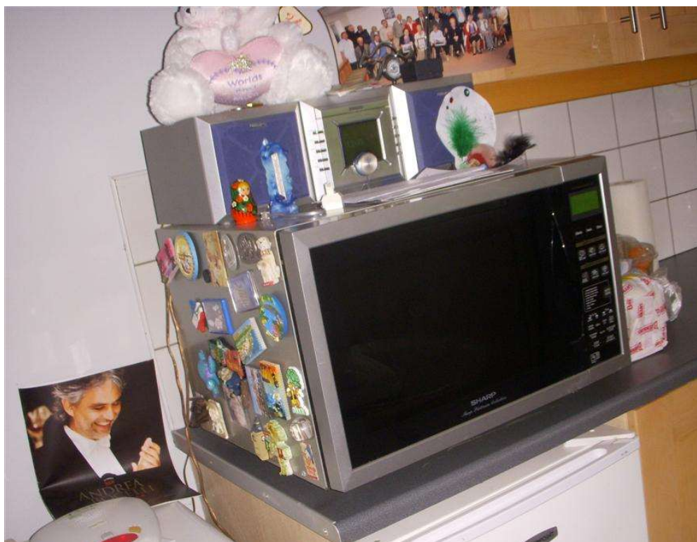
Image 2. A participant uses their microwave as a display focal point for memories and mementos.

In the older people's homes I visited, traditional and contemporary product aesthetic styles coexisted. My informants explained that they did not want to feel stigmatised by 'old-style products,' and they openly embraced modern and contemporary product aesthetics within the home. However, a clear ambiguity or tension exists between their desire for traditional aesthetics, reflecting nostalgic tones and those they grew up with, and contemporary aesthetics, reflecting convenience and modernity. This ambiguity existed as a desire to have cues both to the past and future within material objects displayed in the home. In my observations of their domestic artefacts, modern technology with contemporary styling (e.g., laptops, tablets, and smartphones) showed visual outward statements of intent, possibilities for the future, self-sufficiency, and independence. Contrasted with these were traditionally styled products (some with redundant functionality). Many of the older people used these specifically and explicitly as cues for nostalgia, sentimentality, and memories of positive life experiences. The phenomenon of reflective emotive connections and aesthetics is seen further in product functionality. As a secondary function, cooking and heating products are some of the main visual focal points in the home. Fireplaces, stoves, cookers, and microwaves (see Image 2) provide affordance for displaying material possessions.