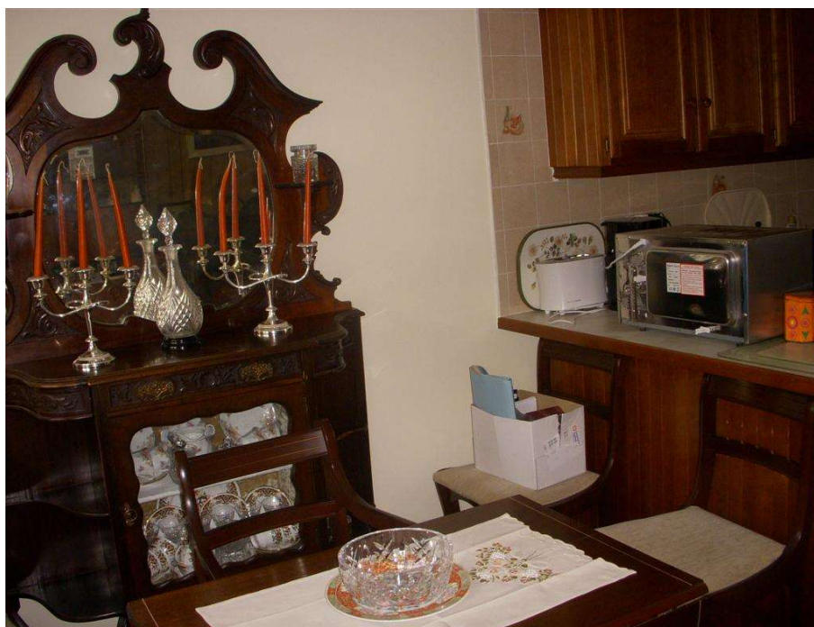
Image 5. This image shows an example of unused dining space. A research participant feels socially isolated following several falls at home. Her dinner parties were her only social outlet, and these have ceased due to her inability to cook.

From my research, dining and eating with family and friends provide one of the most effective means of social inclusion for older people. Many older people rely on this as a daily or weekly source of interaction. Whether it is visiting friends, neighbours or family, having daily meals in a communal space, or being visited in their own home, dining in company provides an essential routine and strengthens the sense of self and independence. Thus, an inability to cook or provide meals can have negative effects on health (Plastow, Atwal, and Gilhooly 2015). From my research, this is seen to not only lead to nutritional issues but also associates itself with older people being socially excluded. Image 5, for example, illustrates the unused dining space of a female research participant who, after a series of falls, had sustained injuries to her wrists and could not cook to her desired standards anymore. Prior to this, her main social outlet was to entertain friends at dinner parties with her talent for cooking. She has had fewer visitors to her home since her falls and her inability to cook and stated: "I miss hosting my dinner parties; after my falls, I can't cook well."