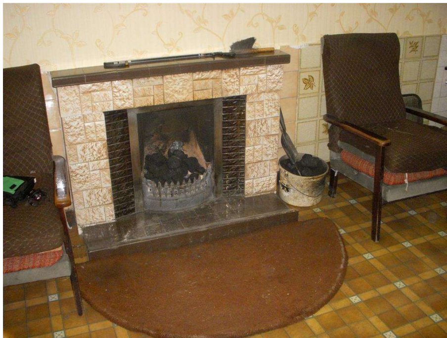
Image 4. A fireplace with seating close by, a gathering point for social interaction.

Social inclusion is a basic need for all humans. Built environments and living spaces have a bearing on loneliness and social inclusion (Lyu and Forsyth 2021). From my research, domestic products play a wide and complex role in older people's sense of social inclusion. I observed in the field that an older adult's ability or inability to use these products seemed to affect their levels of inclusion. Both positive and negative social experiences are derived from the inability to use products and poorly designed usability features. This leads to sometimes more, and at times, less social interaction. In terms of more social interaction, I observed that heating products, for example, provided focal points for social activity, assuming ideal natural gathering points for social interaction, (Image 4) places where memories, stories, and events can be contained, recalled, and shared.