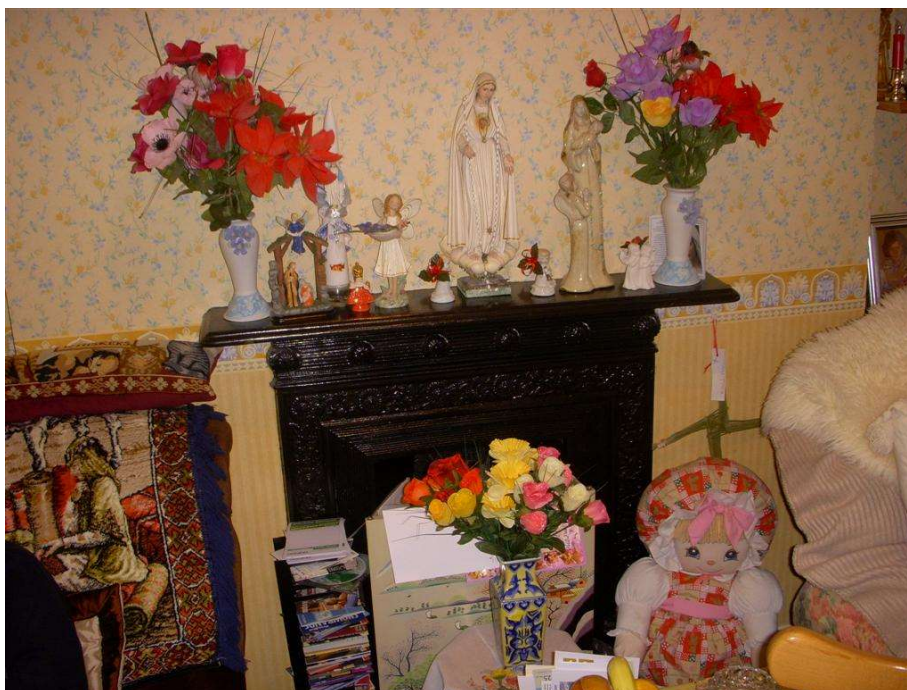
Image 3. An unused fireplace becomes a “reminiscent focal point” for one research participant’s important material possessions.

This gathering of important items for display assumes a highly emotive function for some older adults, suggesting that these are “reminiscent focal points” (White and Devitt 2011) in the home. Developing these emotive functions in products further is of topical interest. Recent research on dementia indicates that the positive effects of reminiscence and remembered experiences may improve the quality of life, cognition, and communication of older people (Woods et al. 2018). This is particularly positive for but is not restricted to, older people living with dementia. In future design development, Human-Computer Interaction researchers Amanda Lazar, Hilaire Thompson, and George Demiris, demonstrate the benefits of developing information and communications technology-supported Reminiscence Therapy for older people (2014). Reminiscence therapy can involve a range of activities to create positive memory triggers, from music interventions and memory-box activities to life storybooks (Macleod et al. 2020).