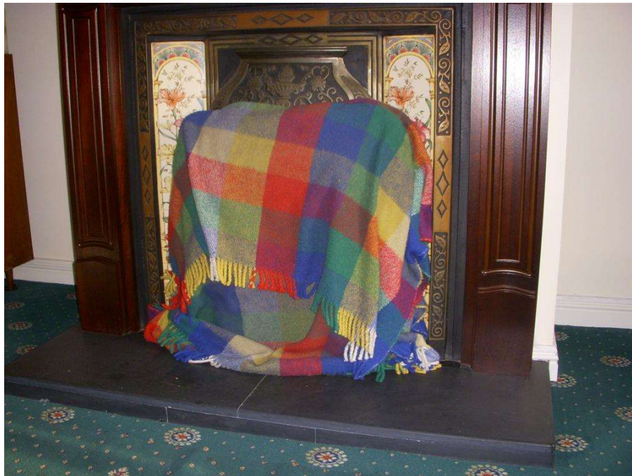
Image 7. A research participant managed the issue of heat efficiency in their living room by covering the fireplace.

In cases of spatial shrink, it is not just the occupant's physical home that is affected; people's self-confidence and pride may also suffer. My research with older Irish people suggests that pride is an ever-present factor concerning household appearance; this pride is seriously diminished when they have to rearrange their living environment due to spatial shrink. This was particularly ubiquitous when older people were restricted to the downstairs floor of their homes solely due to mobility issues. A common occurrence was moving a bed downstairs to the ground floor (as in Image 6). Participants told me that they felt a deep embarrassment in using their living room or kitchen as a sleeping area due to mobility or cost issues. Albeit practical, having a private personal space such as a bed in full view of visiting guests may portray personal or physical weakness. Many of my participants said they were less willing to have guests in their homes because of this. Being confined to limited rooms of the home also resulted in exposing parts and objects of the home they would rather not, such as mobility aids, which could visually communicate and heighten their sense of vulnerability.