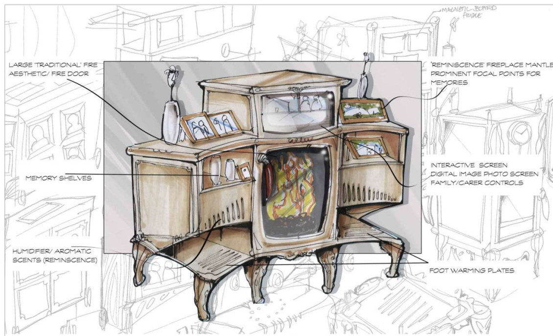
Figure 1. Example of an early-stage sketch conceptualisation idea 'the Social and Emotional fireplace.' Sketch created by author