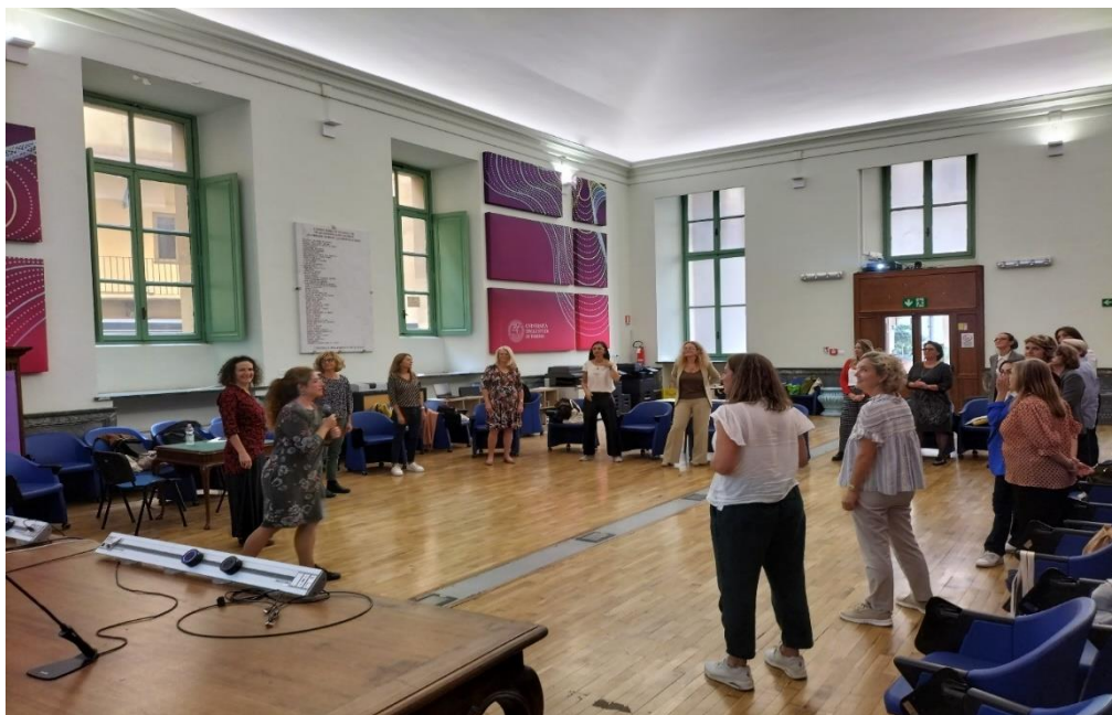
Figure 1: Train the trainers event in Torino