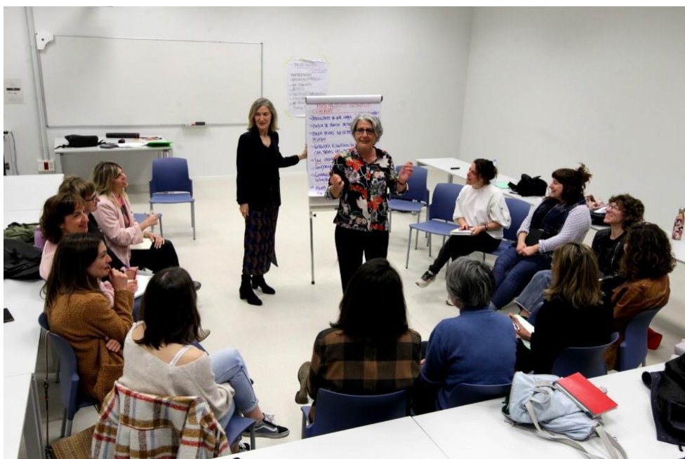
Figure 1. Akademe Programme (University of the Basque Country – ENLIGHT Alliance)

https://www.ehu.eus/documents/2007376/43960833/EHU-Equality-in-figures-2022.pdf/20a4c613-ba40-c8d0-7d72-3183e7f9f9d3?t=1683201166714